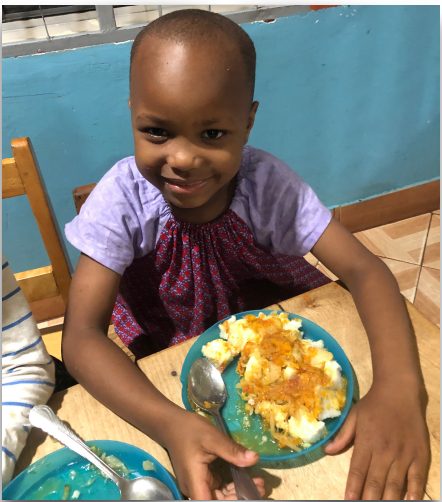
Mealtime at the Orphanage