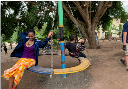
On the Playground