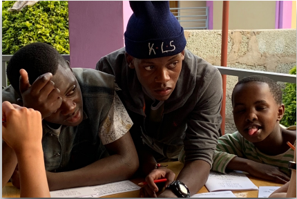
Big Brothers help Little Brother