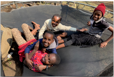
Time to Get a New Trampoline