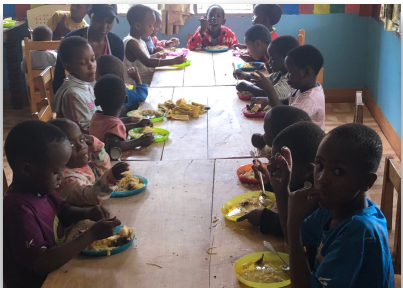
Mealtime at the Orphanage