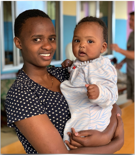
Big Sister helps Little Sister