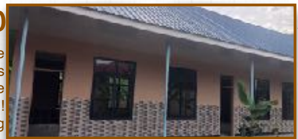
NEW Preschool Building

We're excited to announce the new Preschool/Nursery School is now finished! The classrooms are in and the building looks amazing! The staff is already enrolling students for the new school year.