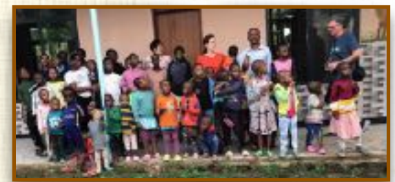
Children and Volunteers

Once again we owe all this to the goodness of God and the generosity of the NGO WATOYA Tanzania e.V. for their work to both fund the project and fully support the staff and students.