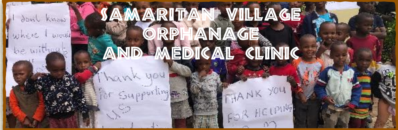
Rescuing and Providing a Home for Orphaned, Abandoned and Trafficked Children